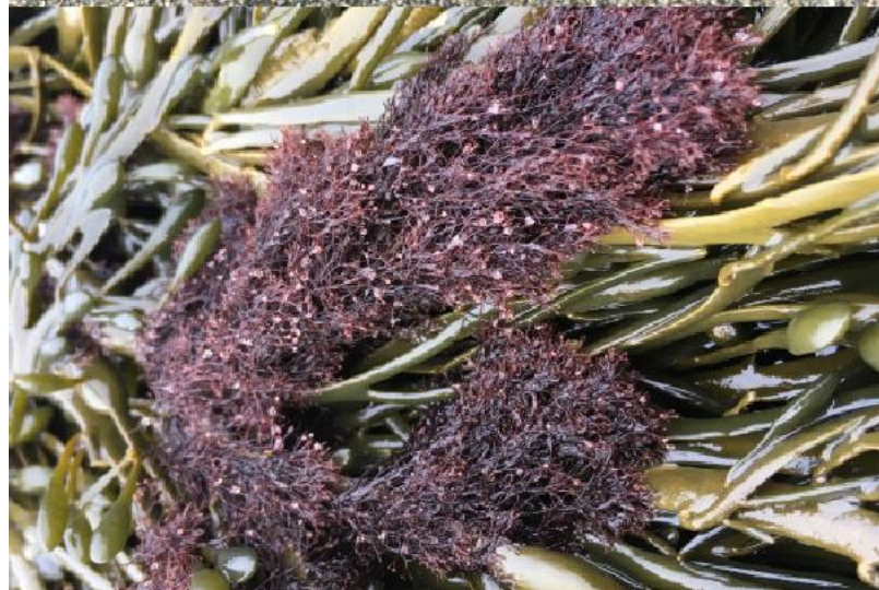
Vertebrata lanoda Wrack siphon weed

Description: A dark purple to red body that is almost iridescent at the tips. The stipe is flattened and then splits into branches.