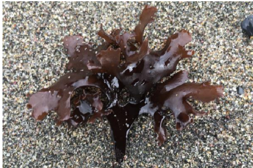
Chondrus crispus Irish moss