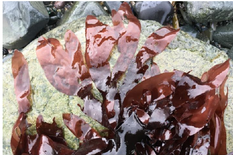
Palmaria palmata Dulse