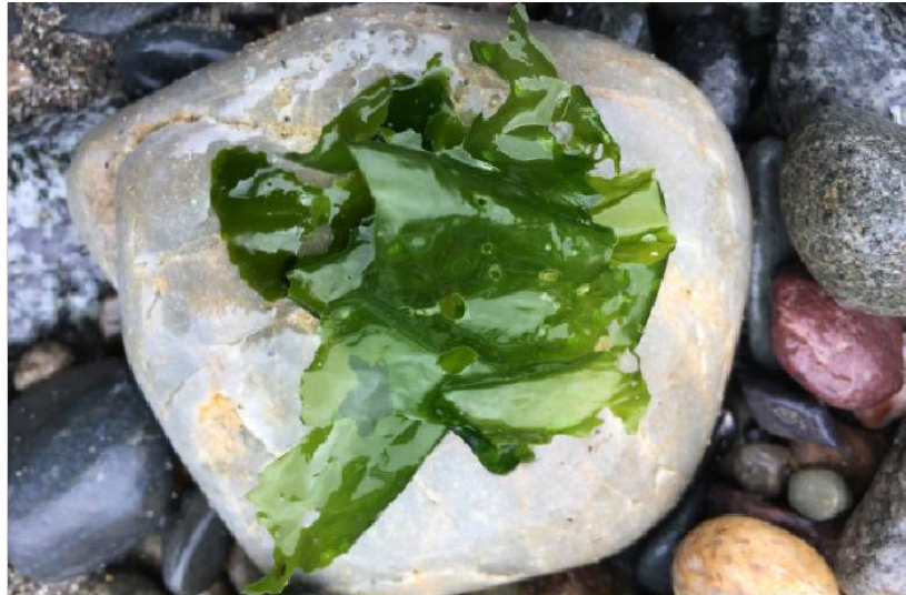
Ulva lactuca Sea lettuce