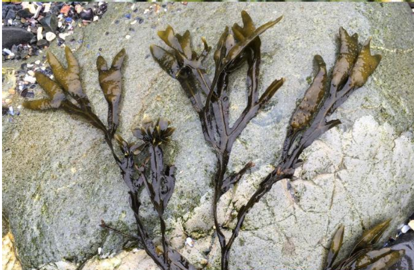
Fucus distichus Rockweed