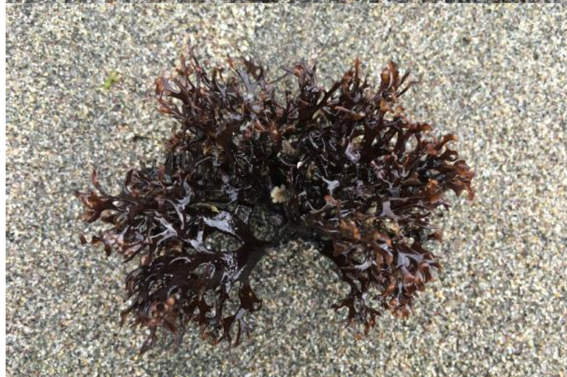
Mastocarpus stellatus False Irish moss