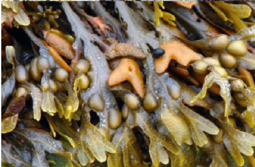
Fucus vesiculosus Rockweed

Description: A brown algae that is a dark green/light yellow in color. It forms strap-like fronds that have air bladders along it.