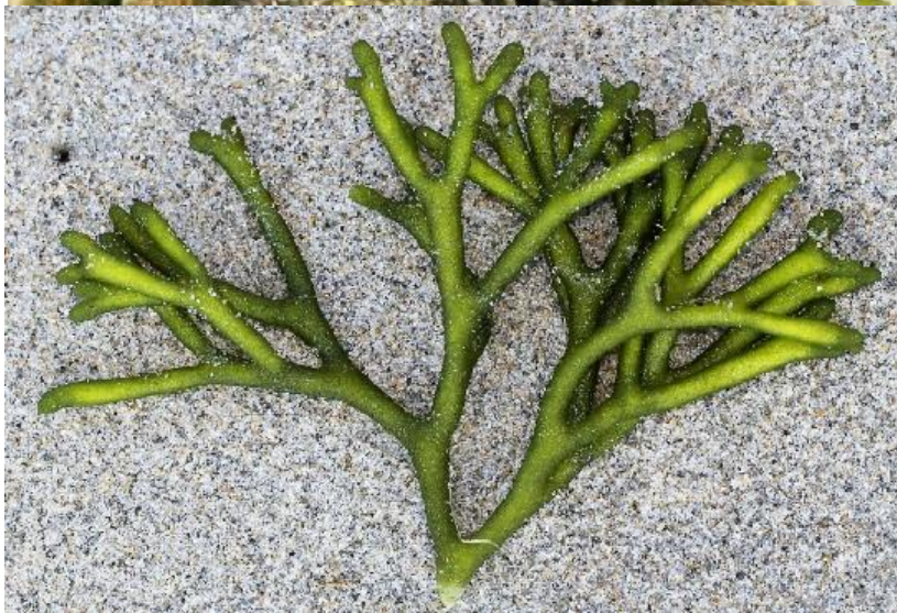
Codium fragile Dead man's fingers

Description: A thin and delicate light green sheet with no stipe —only 2 cell layers thick.