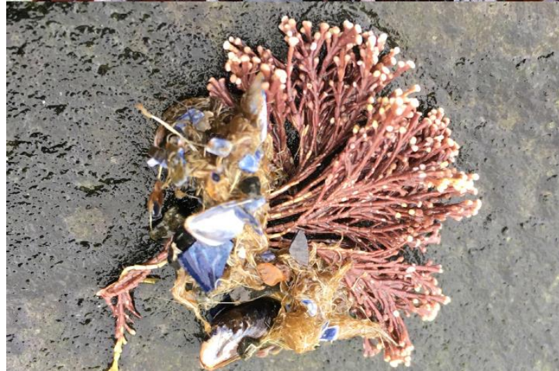
Corallina officinalis Common coral weed

Description: Flattened, leathery red-brown fronds connected by a short stipe . Blade is a long oval that occasionally splits at the tips.