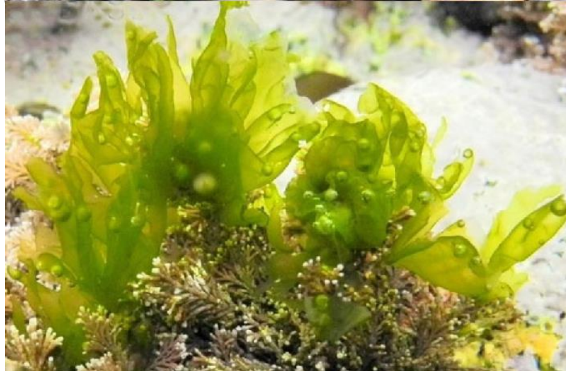
Monostroma grevillei Green laver