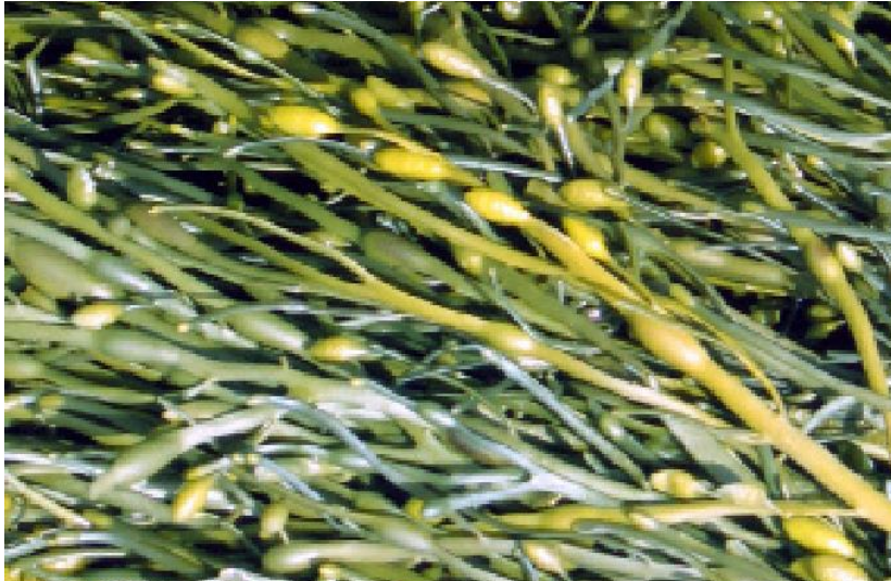
Ascophyllum nodosum Knotted wrack