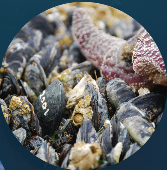
'Robomussels' that record temperature relevant to intertidal mussels are deployed at sites around the world

Helmuth's group is analysing ecologically and economically important coastal organisms and the ways in which their characteristics are altered