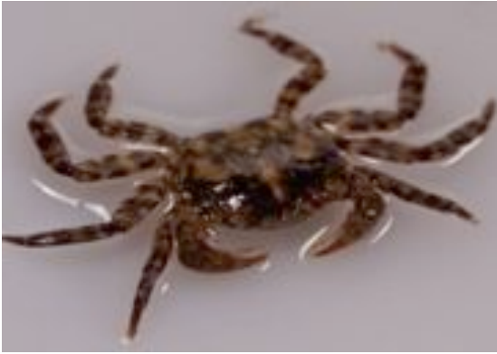
Asian Shore Crab

Northeastern University Marine Science Center