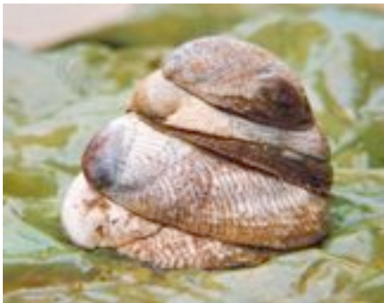
Lady Slipper Snail