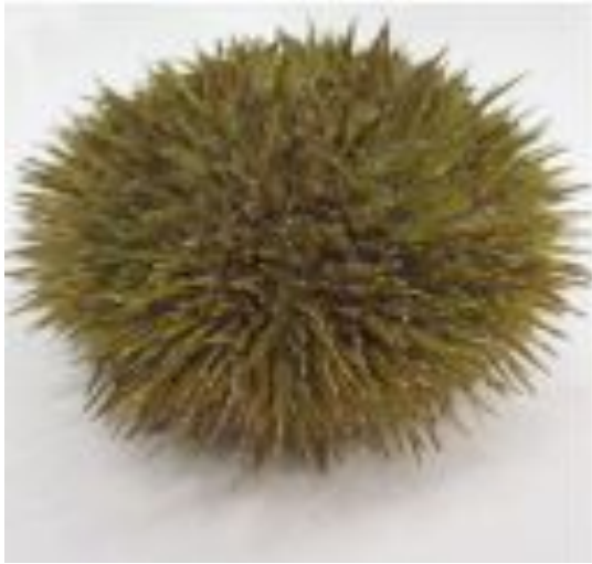
Green Sea Urchin